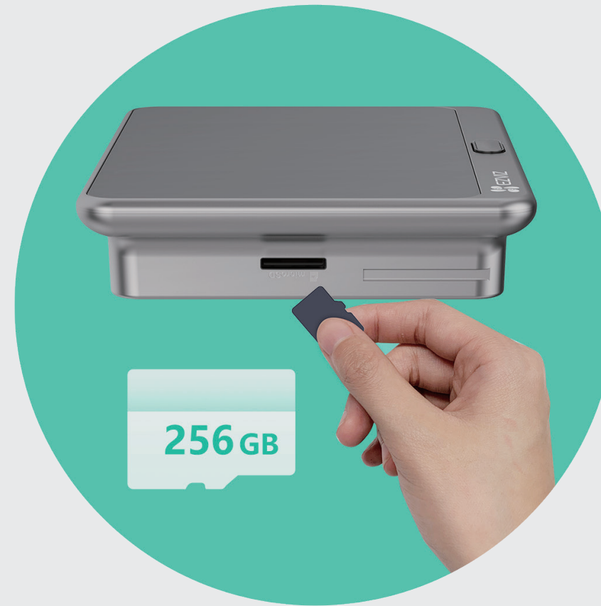
Supports MicroSD Card 3

Save videos locally on a 256 GB storage card, which can be inserted onto the indoor monitor. This guarantees data security in case the outdoor camera is damaged. Or, if you prefer, subscribe to EZVIZ CloudPlay for fully encrypted cloud storage.